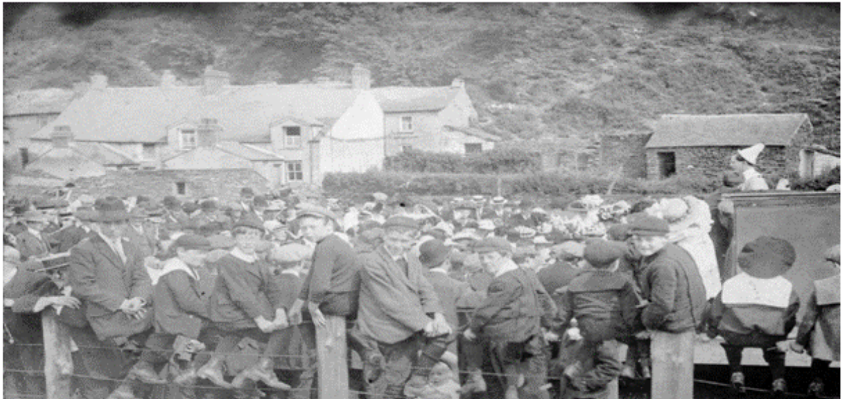
Co-op Jubilee in 1912—commemorating 50 years of the Co-op in Kirkby