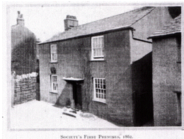
SOCIETY'S FIRST PREMISES, 1862.